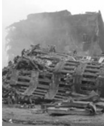
Photo 4 (above, right): The curtain wall of Tower 2, which was referred to as “the coliseum.”