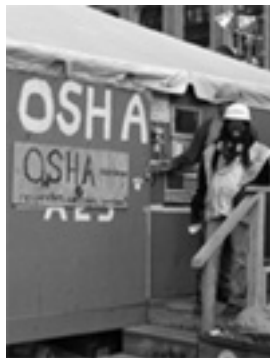
Photo 6 (above, middle): One of OSHA's PPE distribution centers and respirator fit test stations near the disaster site.