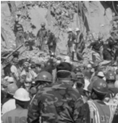
Photo 5 (above left): The site was flooded with people trying to assist, many wearing no or improper PPE.

Each contractor's safety professionals reported to the NYC Dept. of Design and Construction (DDC). Bechtel provided SH&E consultation to the DDC for the entire site. Eventually, the National Guard took responsibility for access control and personnel badges, which substantially decreased work zone control problems. The number of workers at the site dropped from an estimated 10,000 (during the first week) to fewer than 2,500. In addition to firefighters and police department representatives, some 1,500 iron workers and 400 operating engineers were on site, along with many carpenters, laborers and mill workers.