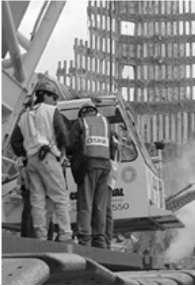
Photo 14 (top): The north face of 130 Liberty St. The broken windows were eventually covered completely with protective, flame-retardant netting.